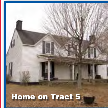
Home on Tract 5

LOCATION: HIGHWAY 79 SOUTH (CLARKSVILLE ROAD) AND MILTON-RILEY ROAD • 2 MILES WEST OF RUSSELLVILLE, KY • BANNERS POSTED